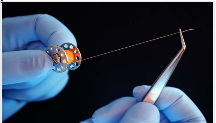
A thread of human CAM can be spooled and used as a suture or can be assembled in a complex tridimensional tissue using classic textile technologies (weaving, braiding, knitting) to create human textiles.